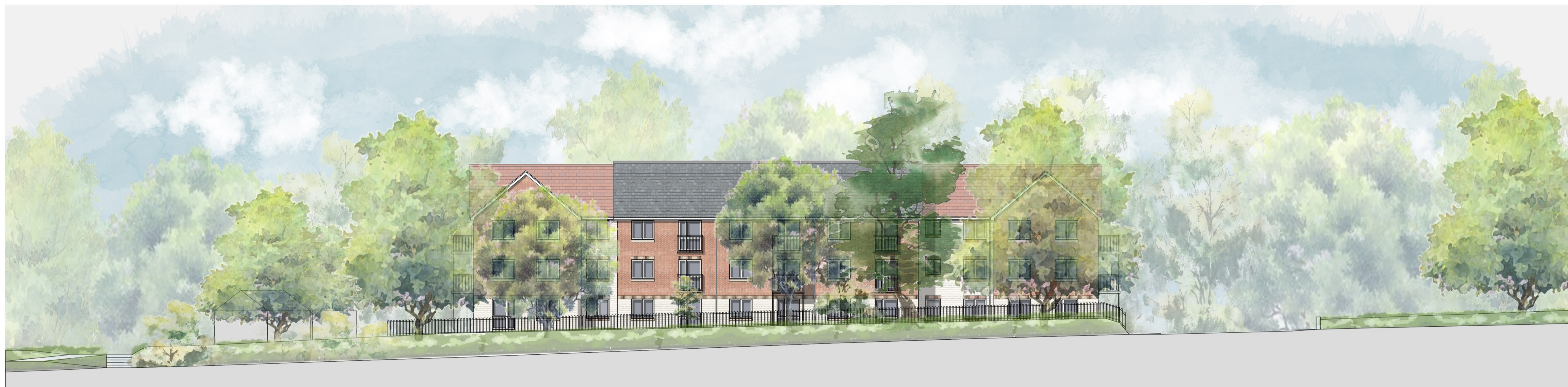
North Elevation 1:150